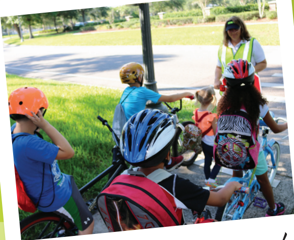
Giving Back to the Community!